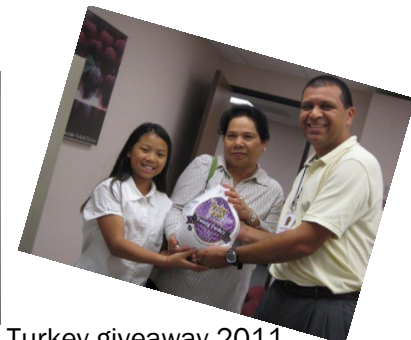
Turkey giveaway 2011